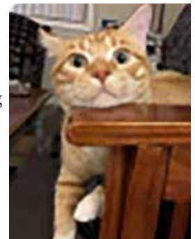
Zany little Eddie