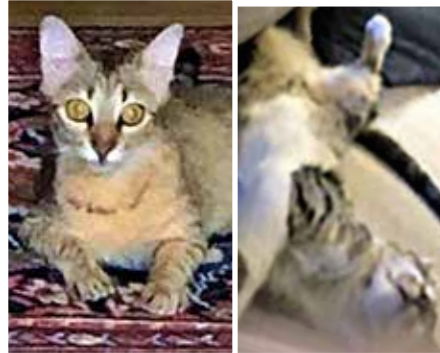
Athena and Zeus