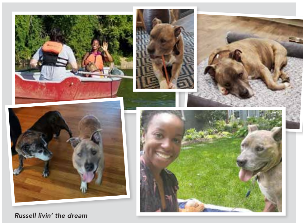
Russell livin' the dream

He mimics his human daddy's sleeping positions. He patiently waits for snacks when Dad cooks in the kitchen, and he somehow knows that