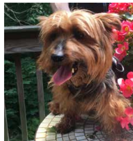
Minnie waits to be adopted

I selected the applications that I thought were good and did the vet checks. I arranged to meet the five families with good vet checks in the parking lot of a local elementary school—spread out over three days. Home visits are now conducted virtually over Facetime with the applicant giving a tour of the house and yard—and walking the fence line if they have one. The family I selected met me in