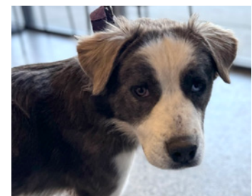
Meet Sephie, our 6,000th adoption.

For 30 years, PAW has helped more than 6,000 pets find loving, forever homes!